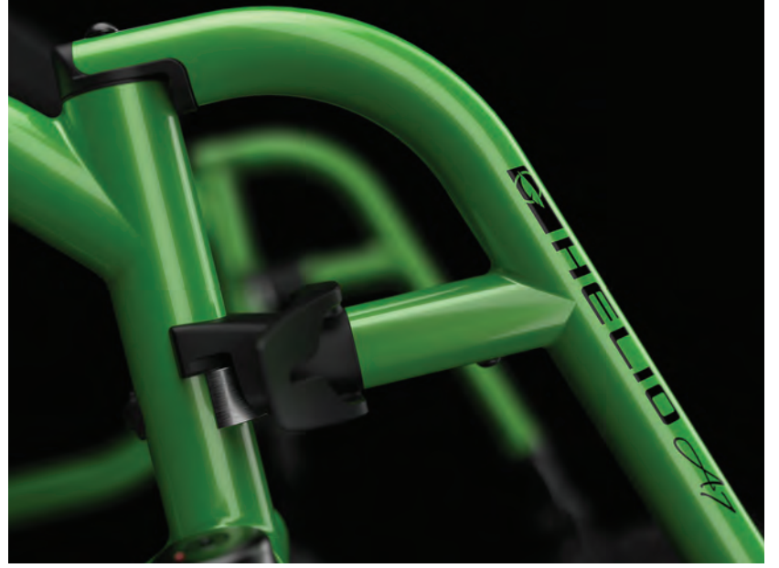
I found a wheelchair that adjusted perfectly to my needs and, above all, competent people to make the most of it.